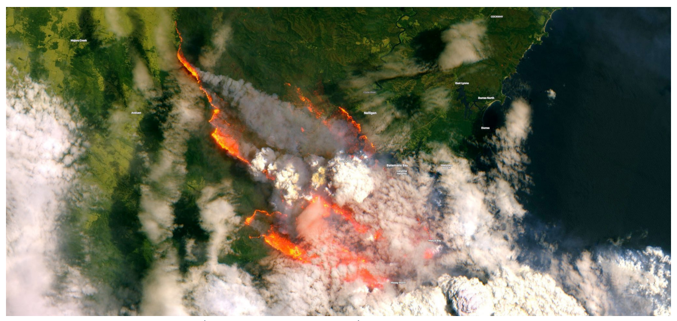
Bateman Bay, Australia, December 2019.

Furthermore, with climate change resulting in increasing temperatures and more areas under drought conditions, and the expansion of more populated areas into the wildland, the potential for widespread loss of buildings, infrastructure and communities located within the wildland-urban interface (WUI) areas will likely increase. As of August 2021, wildfires in Greece were destroying towns and causing a 'disaster of unprecedented proportions', and in the US State of California, the 'Dixie Wildfire' has become the largest wildfire ever in the state, levelling buildings and raising fears that 2021 will be the worst fire year on record. In the US alone, the nationwide expansion of the WUI from 1990 to 2010 was significant in terms of both number of new houses (41% growth) and land area (33% growth), making it the fastest-growing land use type in the conterminous US. The situation is even more extreme in regions of the world with rapid urban development that is encroaching into the wildland. Concerted efforts are needed to stem the fire risks in these wildland-urban interface environments.