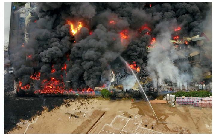
Industrial fire at a plastics factory in Leamington Spa, UK, August 2021

Environmental impact of fire results from fires in the wildland, fires within the built environment, and increasingly, the combination in the wildland-urban interface (WUI). The increasing number, frequency and magnitude of wildland fires means increasing amounts of carbon emissions, losses of natural environment, and in some cases, additional impacts from firefighting chemicals. In the built environment, every building that burns increases carbon emissions from both the fire and the processes, transport and materials used for reconstruction.