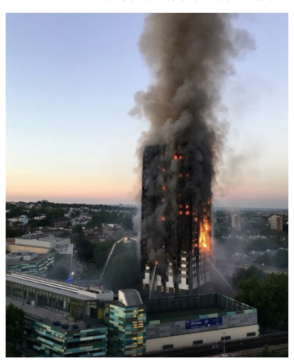
Grenfell Tower Fire (Natalie Oxford, 2017) Creative Commons Attribution 4.0 International license (https://creativecommons.org/licenses/by/4.0/deed.en)

In addition, because of concerns regarding the contribution of the built environment to carbon emissions and climate change, some unintended consequences have developed.