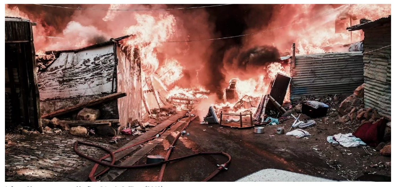
Informal homes consumed by fire.

The cycle can be vicious, and some may never fully recover. The trauma and stress extend beyond families to loved ones and friends as well.