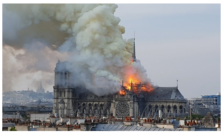
Incendie de Notre Dame à Paris. vue depuis le ministère de la recherche.

also combustible and must be properly configured and protected when used as part of building construction. Unfortunately, many building regulations around the world have been slow to fully address these potentially competing objectives of sustainability and fire resilience. Furthermore, the costs of retrofitting buildings, restructuring the building regulatory approach to fire safety, and economic impacts throughout the construction section have been significant.