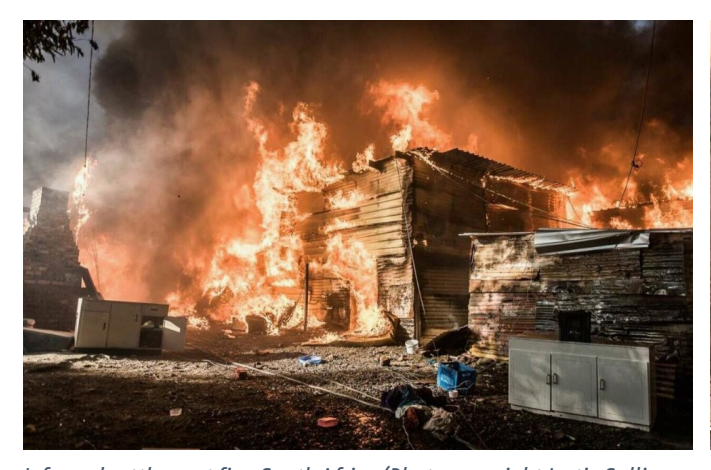
Informal settlement fire, South Africa

Public awareness campaigns play an incredibly important role in making the public aware of how they can better safeguard themselves. They also support the enforcement of legislative measures and standards for fire safety, by increasing awareness of fire risks and of the penalties associated with breaking the law.