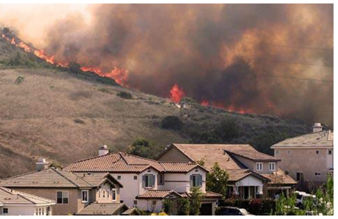
Wildland fire encroaching on neighbourhood.

Fire safety provisions within building and fire regulations (codes) establish a minimum baseline for fire performance expectations for new construction. Training, education, qualifications and credentialling mechanisms establish the baseline skills and knowledge for practitioners in the system – from tradespersons to technicians, architects to engineers, fire prevention officers to code enforcement officials, manufacturers to insurers, and all others who play a role.